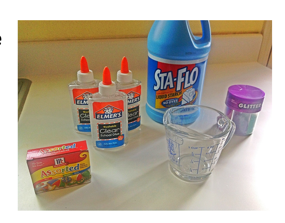
That's it! Oh, and have some paper towels on hand...